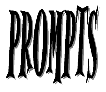
53<sup>rd</sup> Season The Newsletter of the Heidelberg Theatre Company Inc. Inc. No. A0008432X