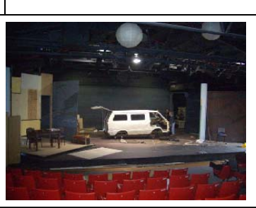
5. Previously we'd prepared a platform fitted with castors. The van was tipped over onto this and lifted into position.