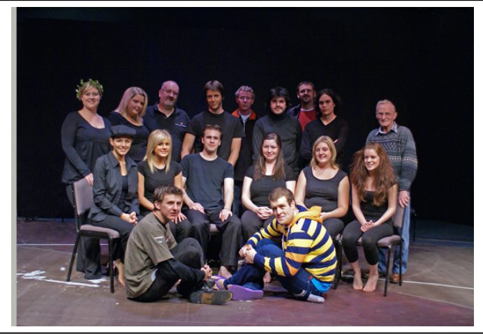
(above: the Cast & Crew of Shakespeare's Shorts)

Any reservations I may have had were swept away in the final minutes of the play, which were as moving as anything I have ever experienced in a theatre.