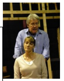
Rehearsal shots from Cloudstreet