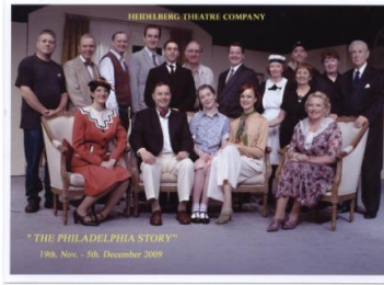
above: Cast & Crew of The Philadelphia Story , right: Cast & Crew of Alice .