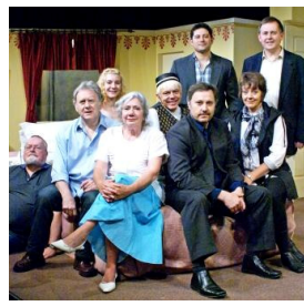
above: Cast & Crew of The Painkiller right: Cast & Crew of The Wizard of Oz .