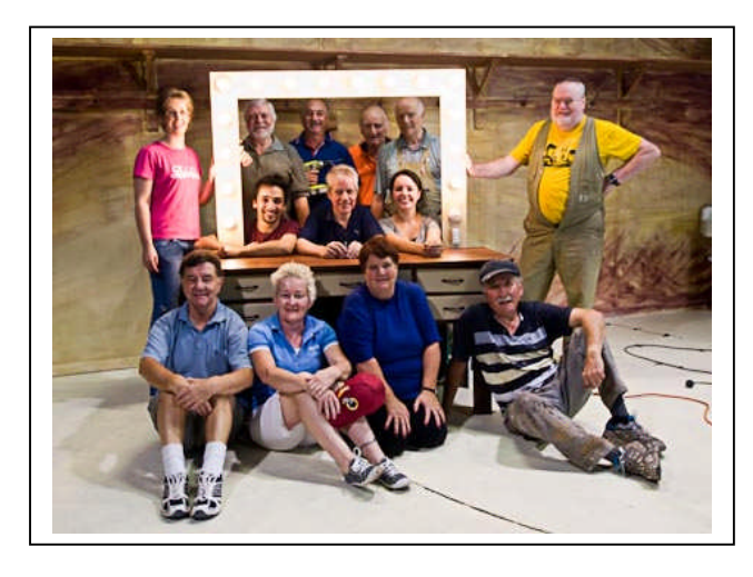
below: This time the set designer, set building team and stage manager for The Dresser have their turn in front of the camera.

the wall and downstage audience right was the stage manager's desk complete with light. A great collection of sound instruments were placed down right for the storm sequence.