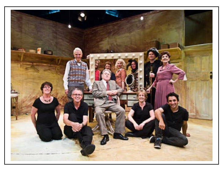
above: The cast, crew and director of The Dresser pose for the camera.